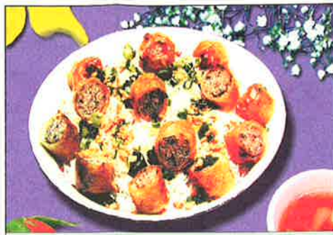
63. Bún Chả Giò