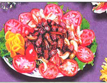
104. Bò Lúc Lắc