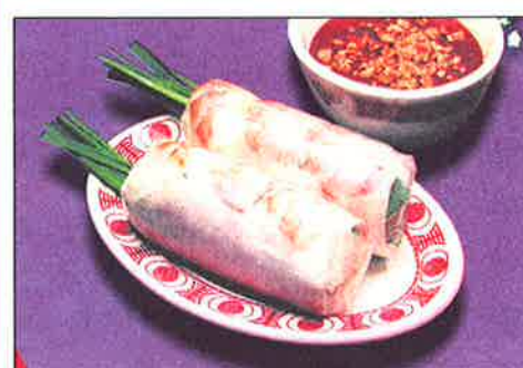
20. Gỏi Cuốn