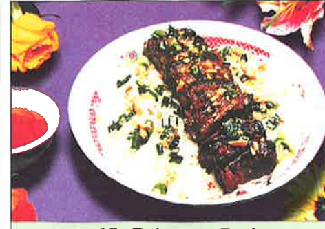
65. Bún Bò Lụi