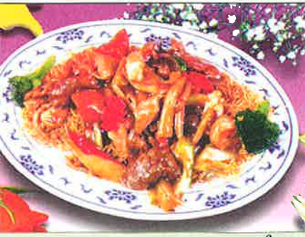
148. Mì Xào Dòn Đồ Biển