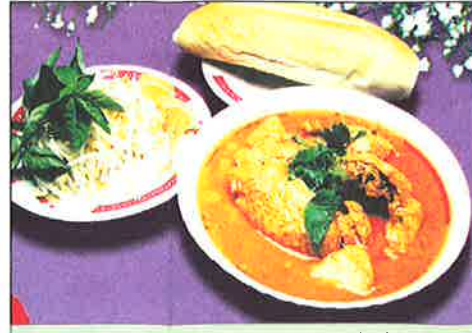
55. Bánh Mì Cà Ri Gà