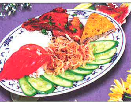
178. Com Sườn Bì Chả