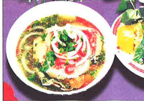
1. Phở Xe Lửa