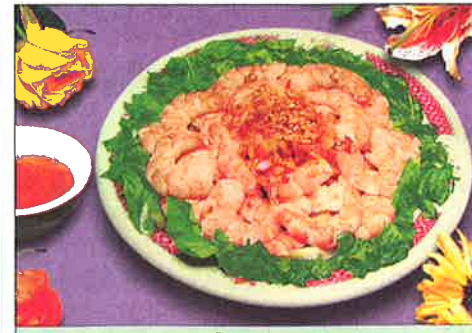
25. Gỏi Tôm Sứa