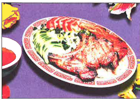
176. Com Sườn Nướng