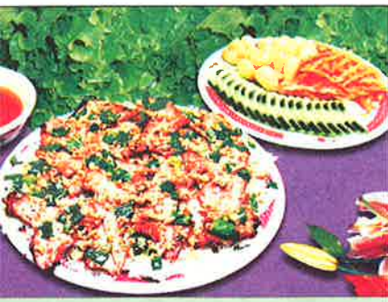
48. Bánh Hủ Thịt Nướng