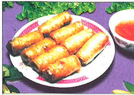
24. Chả Giò