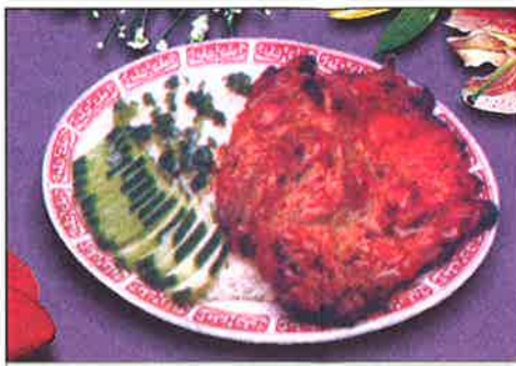
167. Com Gà Nướng