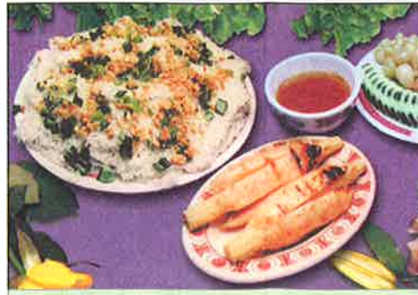
52. Bánh Hủ Chạo Tôm