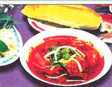
56. Bánh Mì Bò Kho