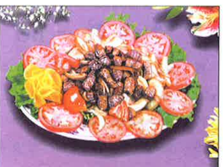
84. Bò Lúc Lắc