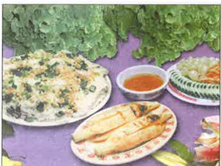
40. Bánh Hủ Chạo Tôm