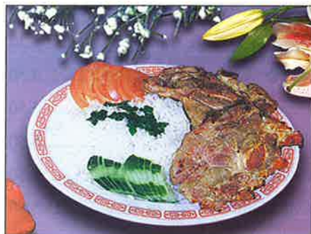
117. Cơm Gà Nướng