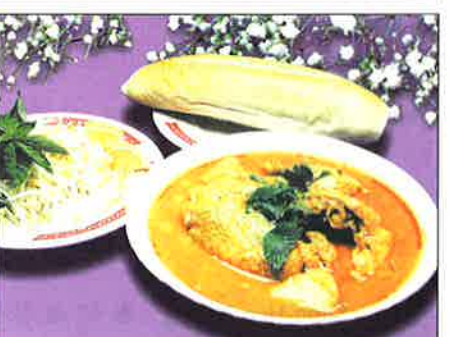
43. Bánh Mì Cà Ri Gà