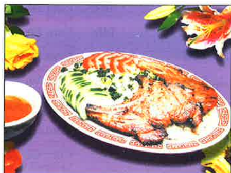
126. Cơm Sườn Nướng