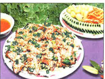
37. Bánh Hủ Thịt Nướng