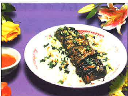
49. Bún Bò Lụi