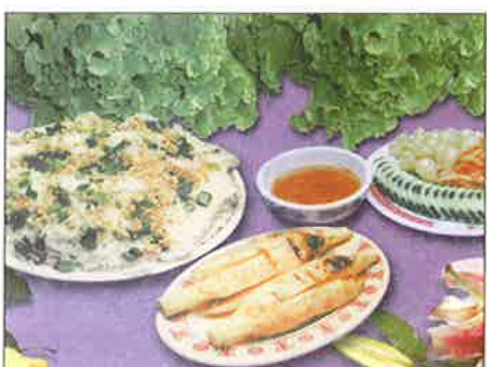
40. Bánh Hủ Chạo Tôm