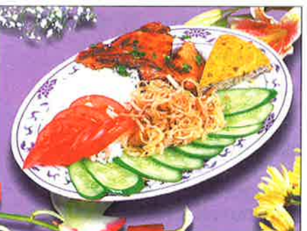
128. Cơm Sườn Bì Chả