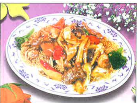
19. Mì Xào Dòn Đò Biển