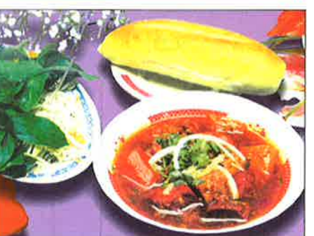
44. Bánh Mì Bò Kho