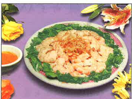
28. Gỏi Tôm Sứa