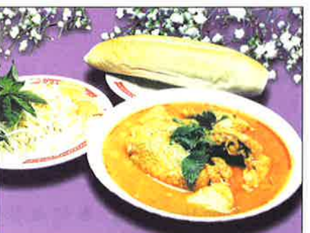
43. Bánh Mì Cà Ri Gà