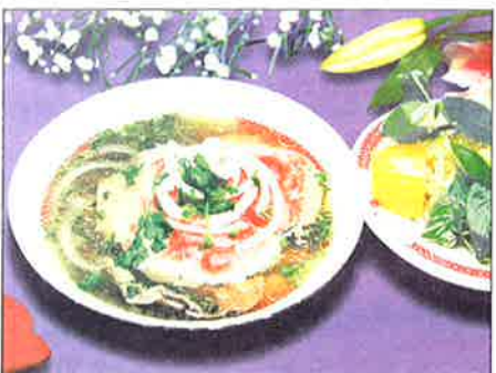
1. Phở Xe Lửa