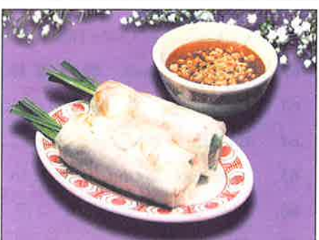
23. Gỏi Cuốn