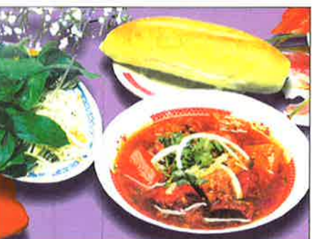
44. Bánh Mì Bò Kho