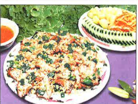
37. Bánh Hủ Thịt Nướng