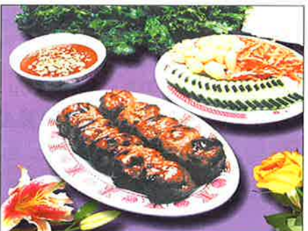
42. Bánh Hủ Nem Nướng