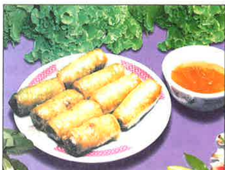
27. Chả Giò