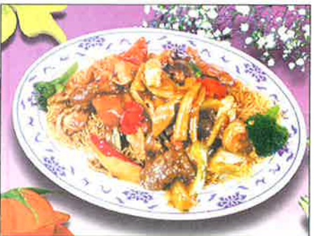
19. Mì Xào Dòn Đò Biển