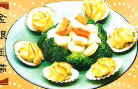
020. French Style Sauteed & Baked Scallops.....20.95