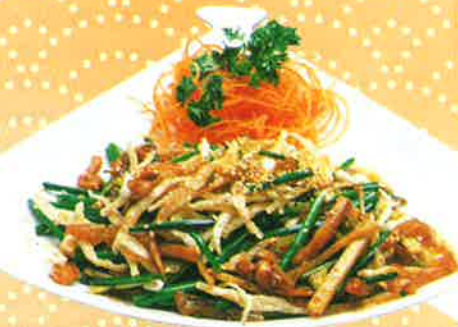
022. Sauteed Crispy Shredded Squid, Baby Silver Fish & Roots.....16.95