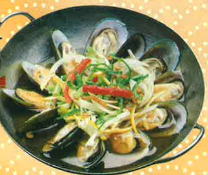
015. Chilean Mussels, Red & Green Peppers w. Thai Basil Spicy Sauce.....12.95