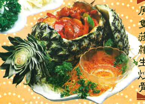
036. Sweet & Sour Pork Ribs served in Fresh Pineapple.....13.95