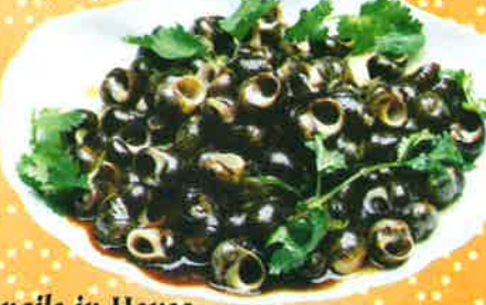
030. Snails in House Special Sauce.....10.95