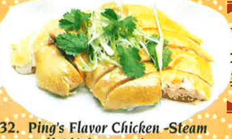
032. Ping's Flavor Chicken - Steam Half Chicken w. Ginger & Scallion Sauce.....10.95