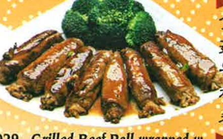
029. Grilled Beef Roll wrapped w. Exotic Asian Mushrooms....15.95