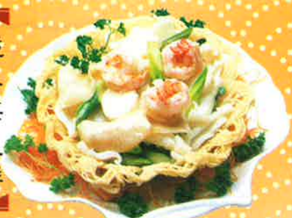
013. Sauteed Mixed Seafood in Crispy Nest.....16.95