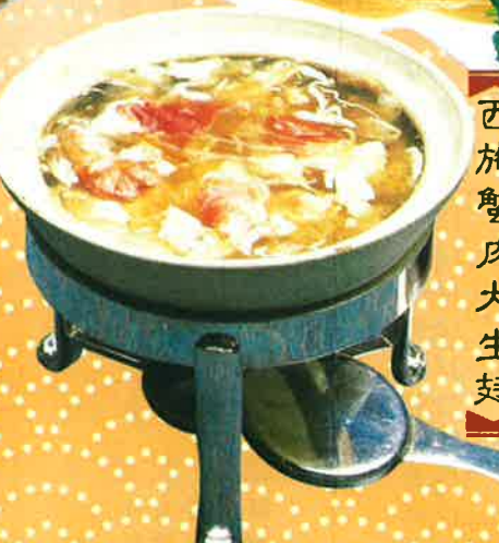
033. Sharks Fin w. Crab Meat & Egg White in Creamy Soup.....18.95