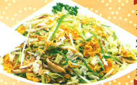
027. Stir-fried Vermicelli w. Shredded Egg & Asian Greens...13.95