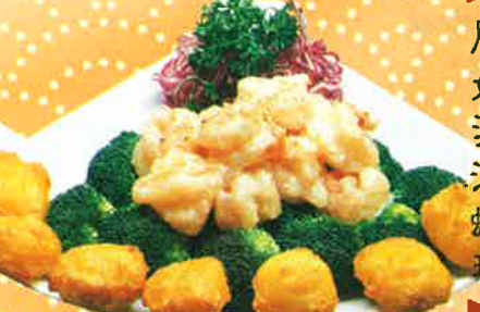
028. Prawns in Cream Sauce Flavor & Fried Milk.....18.95