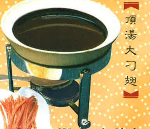
035. Superior Shark's Fin Soup...70.00