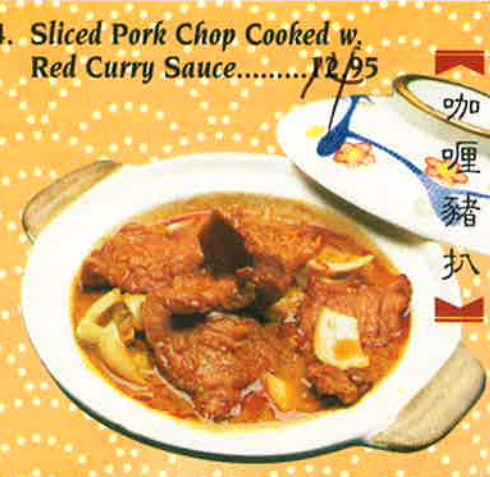
034. Sliced Pork Chop Cooked w. Red Curry Sauce.....12.95