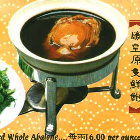
037. Chinese Five Spice Flavor Braised Whole Abalone....每兩16.00 per ounce