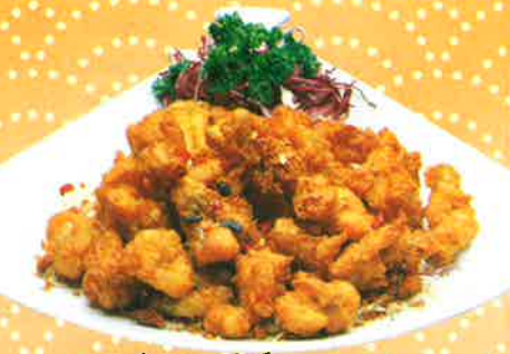
021. Crispy Fried Frog w. minced Garlic.....18.95