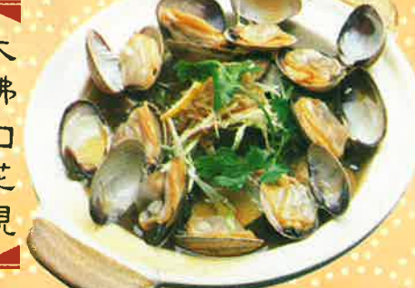
018. Manila Clams cooked w. Chinese Wine & Caribbean Spicy Sauce .....13.95