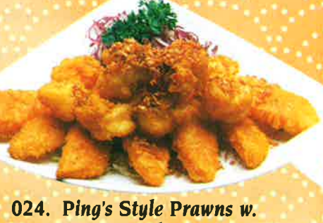
024. Ping's Style Prawns w. Yam Dumpling.....18.95