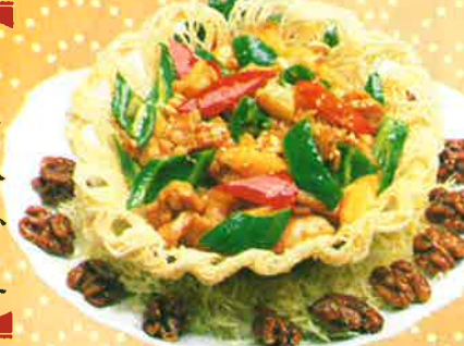
014. Sauteed Scallops, Shrimps & Pig Stomach w. Spice XO Sauce.....16.95