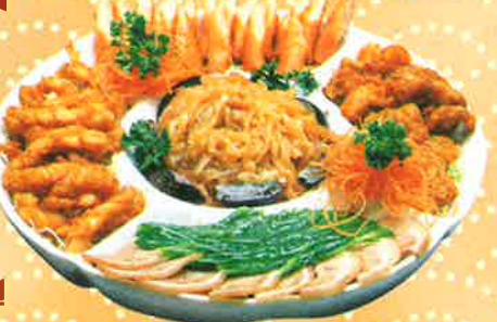
019. Shrimp Roll, Jelly Fish, Pork Ribs, Bitter Melon, Sliced Soy Pork, Mixed Platter.....28.95