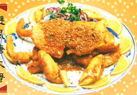
017. Crispy Minced Garlic Fried w. Dungeons Crab.....Market Price