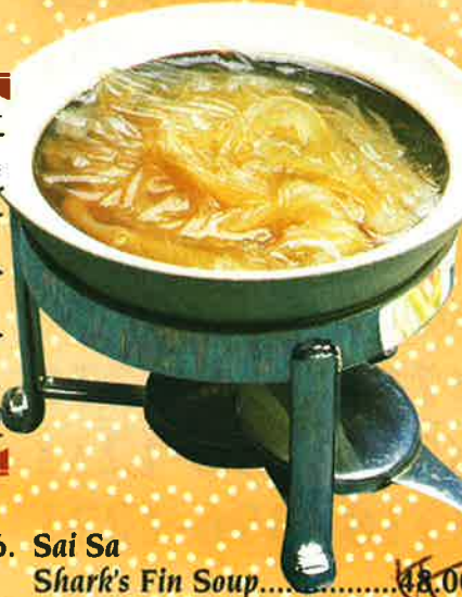
016. Sai Sa Shark's Fin Soup.....18.00