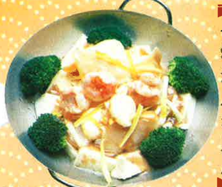
026. Braised Soft Bean Curd w. Mixed Seafood.....16.95