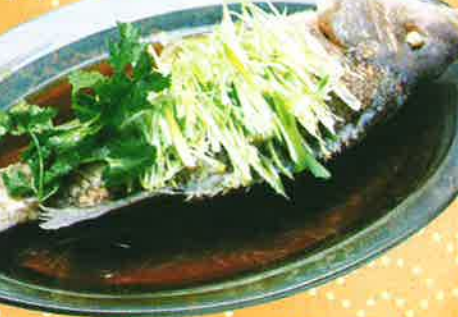
025. Steam or Fried Whole Fish w. Ginger & Scallion.....Market Price