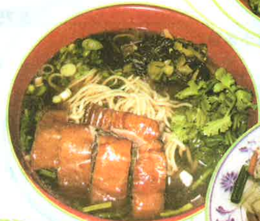
燒鴨拉麵 Roast Duck Hand Pulled Noodles $5.50