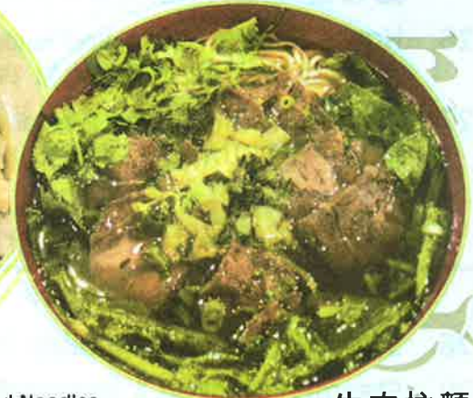
牛肉拉麵 Beef Hand Pulled Noodles $4.75

Choose Different Noodles You Like 可供選擇麵類如下圖