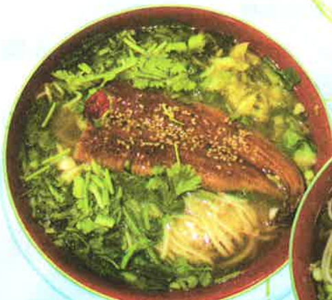
碳燒鰻魚拉麵 Eel Hand Pulled Noodles $5.50