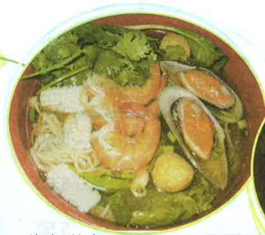
海鮮拉麵 Seafood Hand Pulled Noodles $6.50