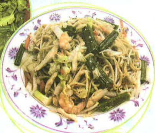
炒雞和蝦拉麵 Pan Fried Chicken & Shrimp H.P. Noodles $6.00