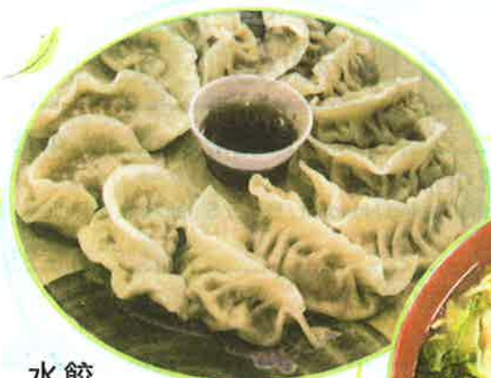
水餃 Homemade Steamed Dumplings