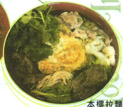
本樓拉麵 House Special Hand Pulled Noodles $6.00