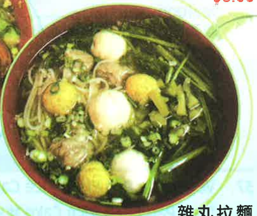
雜丸拉麵 Mixed Fish Ball Hand Pulled Noodles $4.50