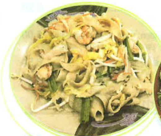
炒雞和蝦刀削麵 Pan Fried Chicken & Shrimp Knife Peeled Noodles $6.00