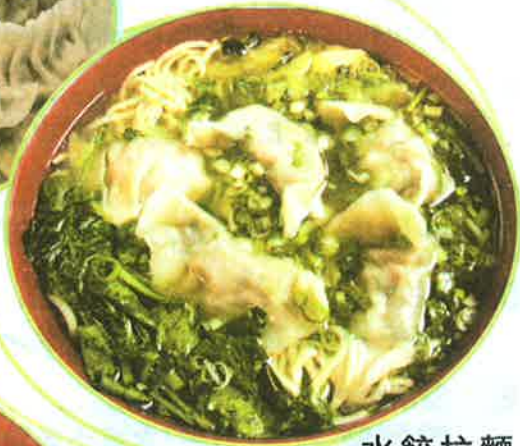
水餃拉麵 Dumplings Hand Pulled Noodles $4.75